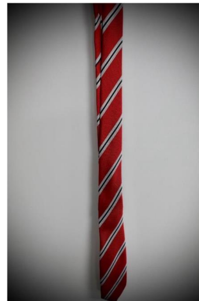
Current Year 7 tie 2025/2026