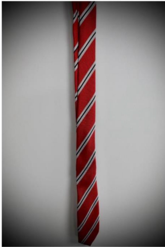
Current Year 7 tie 2025/2026